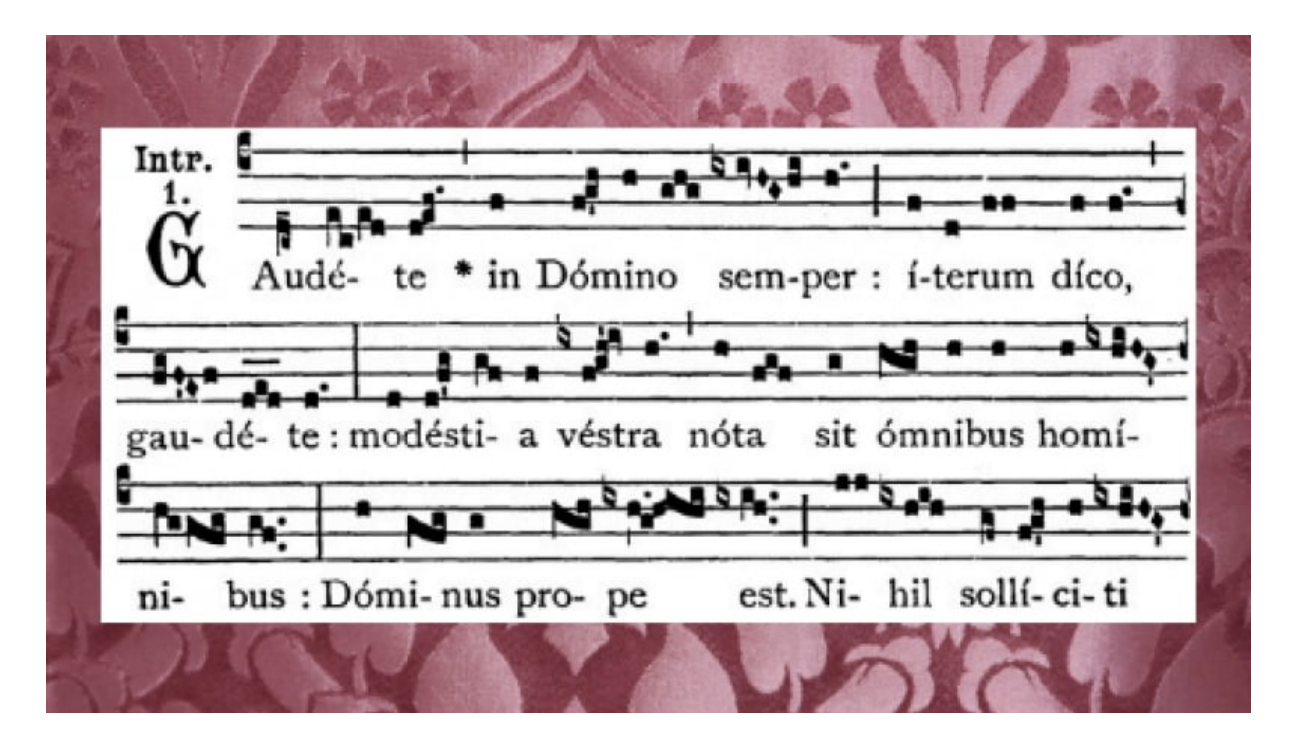
Sunday 11th December 2022-Gaudete Sunday-Year A

Refreshments in the hall after 11am Mass