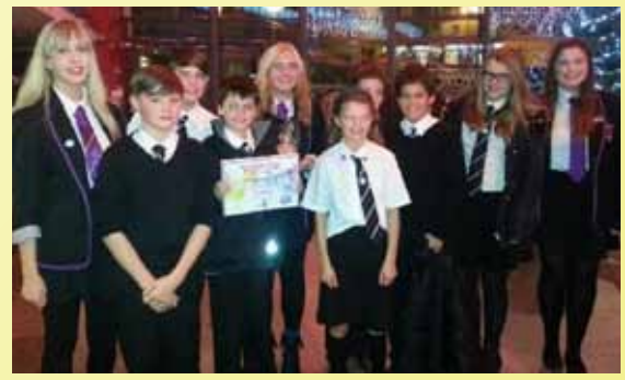
Rights Respecting Group at the Spirit of Youth Awards

Other activities that have taken place in the school are our One Day One Dodge event where our school houses played against each other in dodgeball tournaments using a set of rules devel-