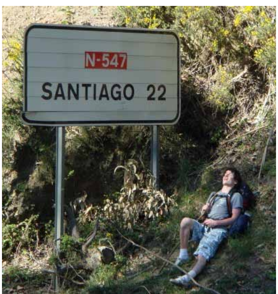
Only 22 km to go Santiago slowly here we come

Once they reach Santiago de Compostela, they will be able to relax in the mediaeval city with its narrow streets and beautiful open squares that are made for strolling along, particularly in the Old Quar-