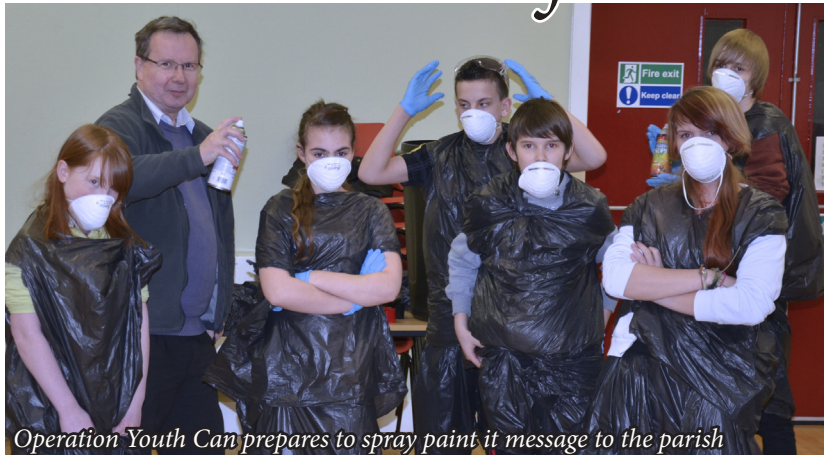
Operation Youth Can prepares to spray paint its message to the parish

Throughout Lent 2013, the youngsters at 3GY worked on a series of service projects aimed at demonstrating how the Catholic Faith is lived out in the wider world. Youth Can aimed to identify a charity worthy of support and then, through public-