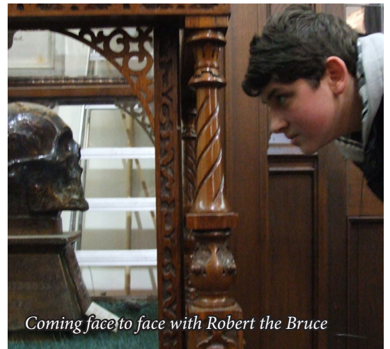
Coming face to face with Robert the Bruce

A tomb was discovered containing the remains of Robert the Bruce, identified by a shroud of gold