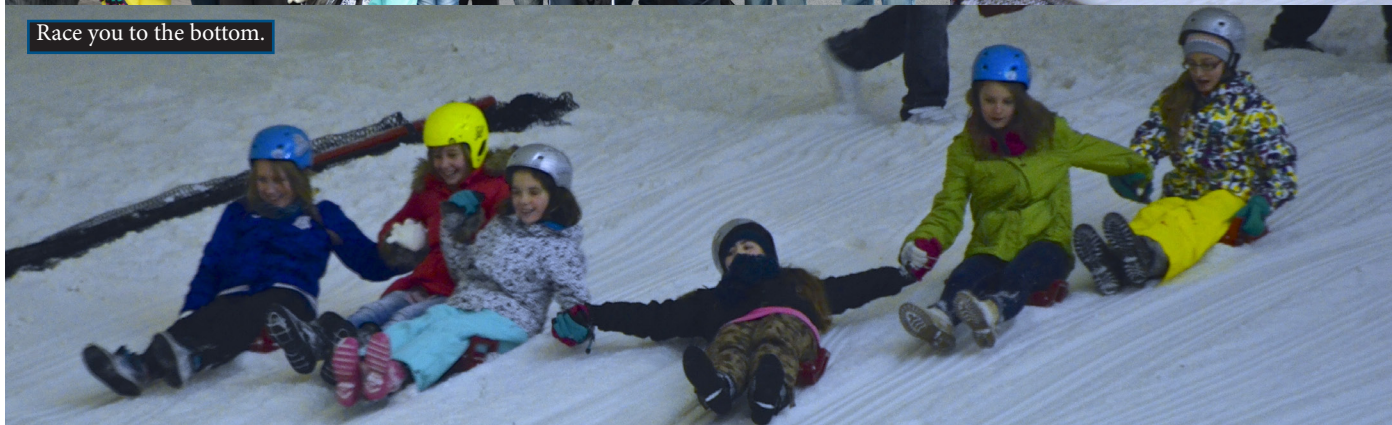
Race you to the bottom.