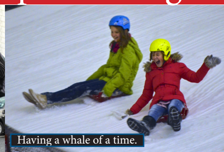
Having a whale of a time.