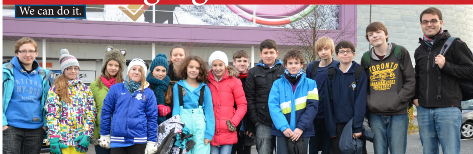
We can do it.