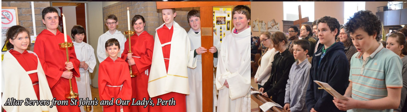
Altar Servers from St John's and Our Lady's, Perth