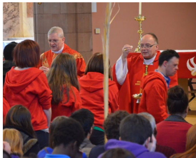
Communion for the Youth of Scotland