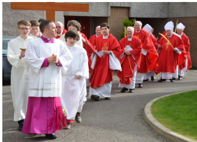
Priests and Bishops lead the procession to Mass