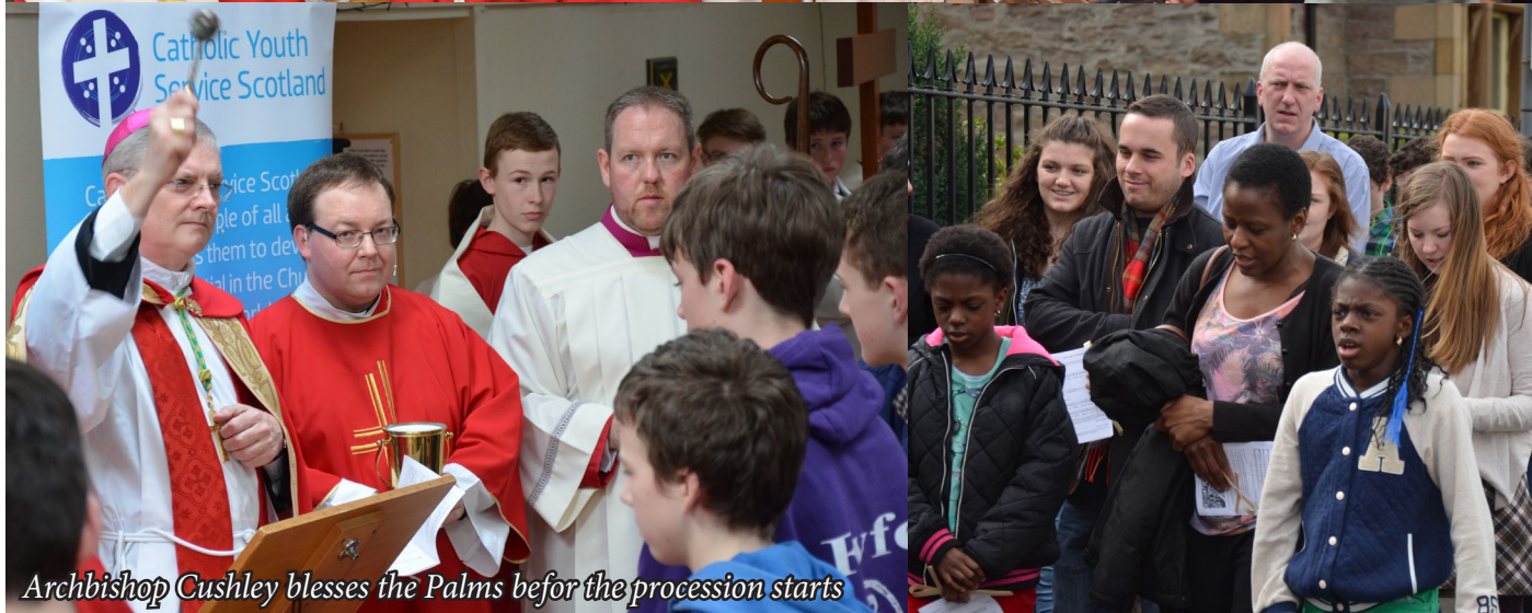
Archbishop Cushley blesses the Palms before the procession starts