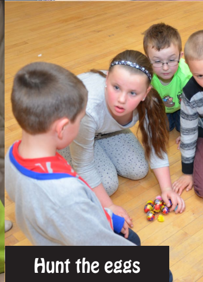
Hunt the eggs