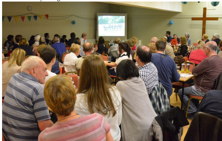
Latest plasma screen technology means everyone can see