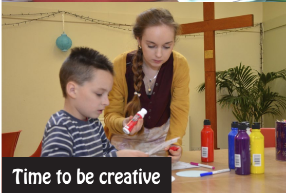
Time to be creative