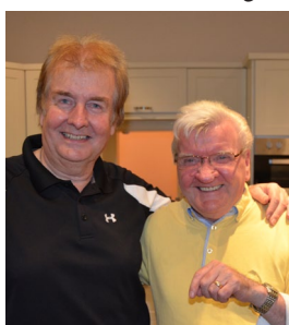
Best bar staff at St John's

Local businesses sponsored whole races up front, the horses themselves were quickly snapped up by those who fancied their chances to make a quick fortune. Only the jockeys were left to be auctioned on the night itself.