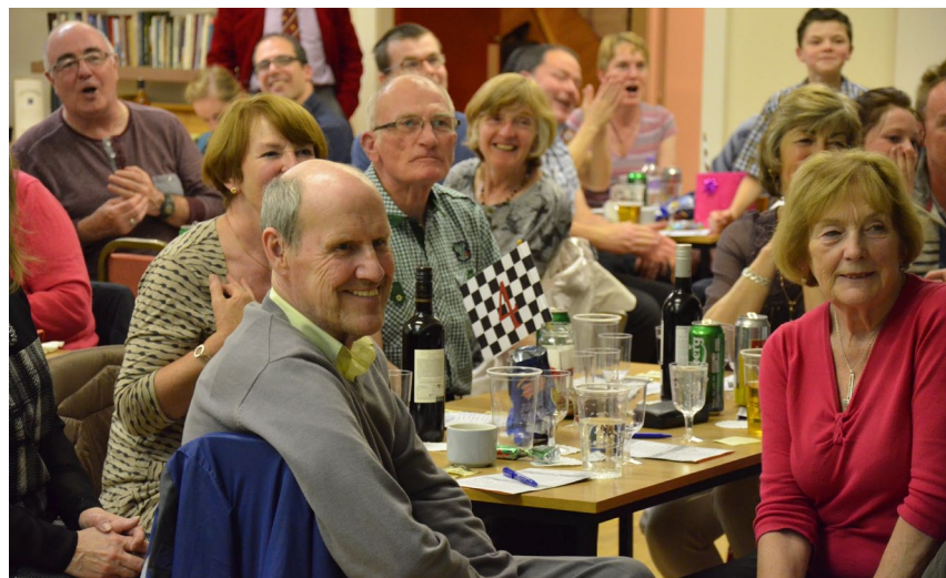
Entertainment for all generations