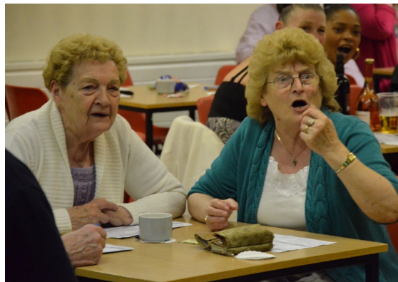
Nail biting moments