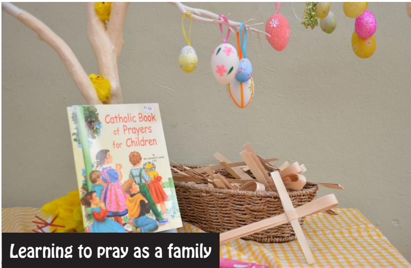
Learning to pray as a family