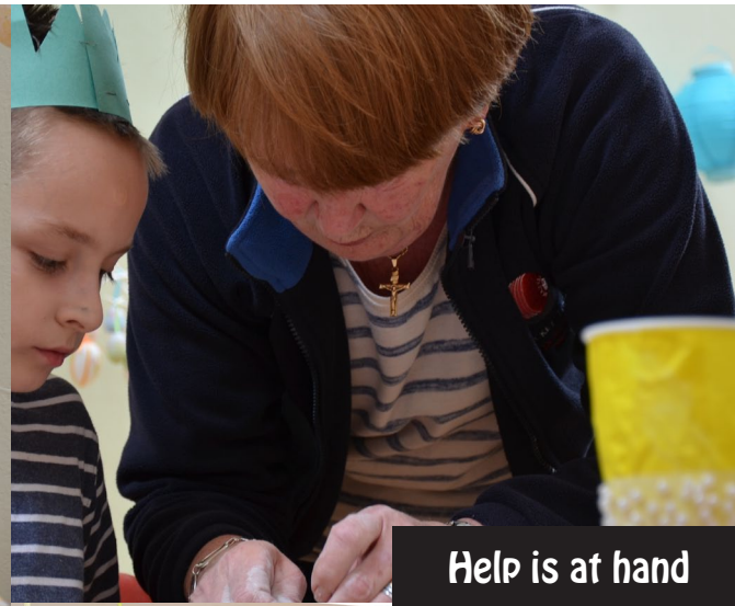
Help is at hand