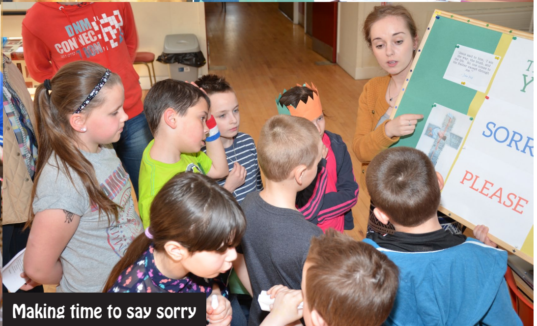
Making time to say sorry