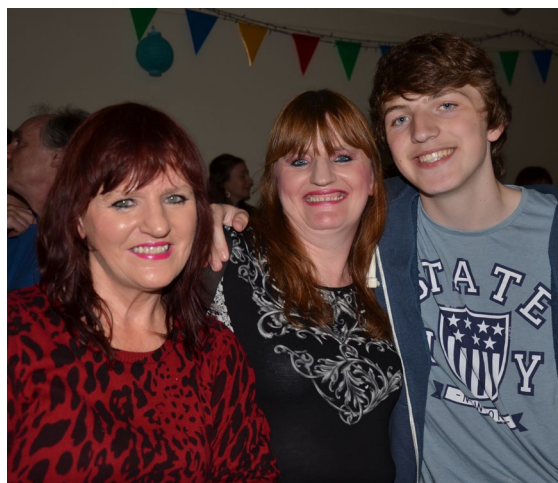
A great family occasion

Well done to everyone who contributed to the success of the evening. £2300 was raised and a great time was had by all.