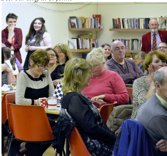
Concentration needed - its like Bingo with legs!