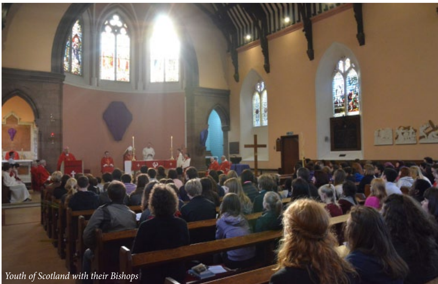
Youth of Scotland with their Bishops