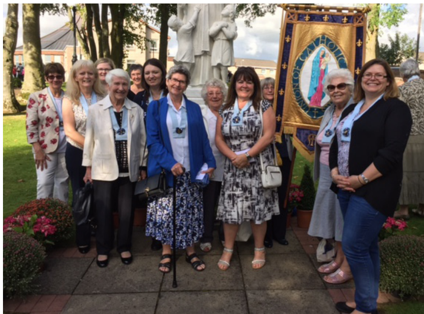
Members of St John's and Our Lady's branches of the Union of Catholic Mothers attending the National Pilgrimage in honour of St Margaret of Scotland last Sunday, at Carfin.